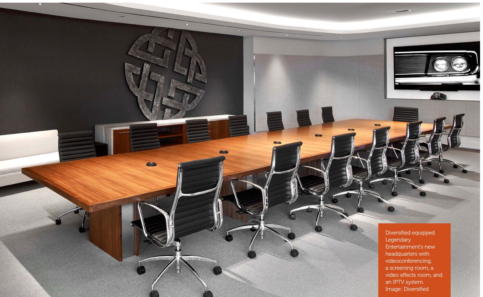
Diversified equipped Legendary Entertainment's new headquarters with videoconferencing, a screening room, a video effects room, and an IPTV system.

where tracking was not possible before—exactly those spaces where people need it in now—the larger boardrooms, multi-purpose rooms, and classrooms.