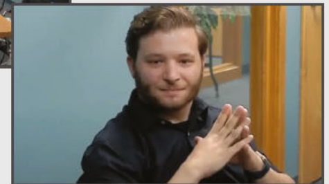
With automated camera switching