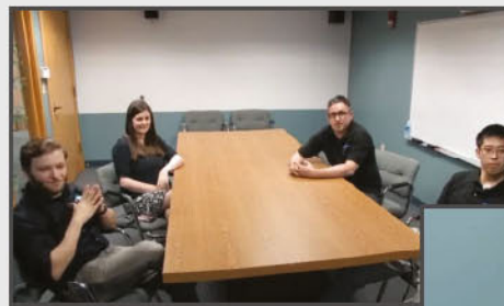
Traditional single camera view

Live stream, record and/or video conference with traditional or soft codecs like Zoom.